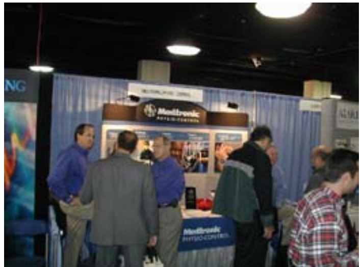
Medtronic Physio Control booth in the Exhibit Hall