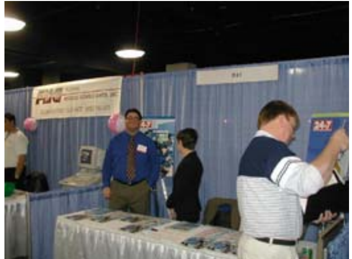
The 24x7 booth in the Exhibit Hall