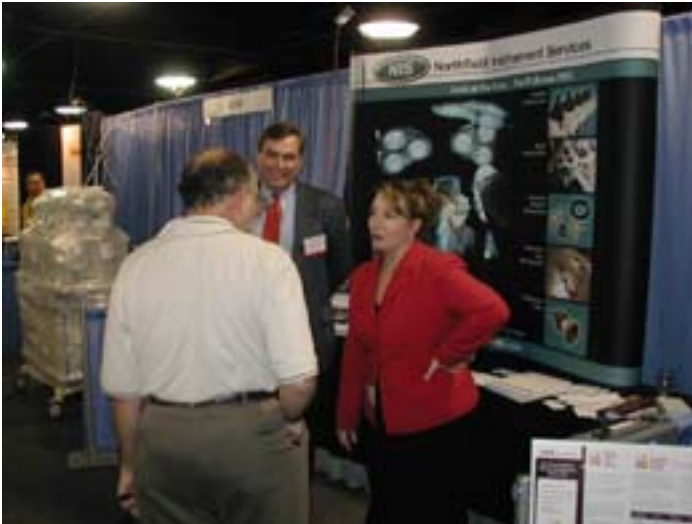
Northfield Instrument Services in the Exhibit Hall