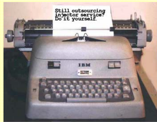
Get trained in Charlotte in March 2012 by Maull Biomedical