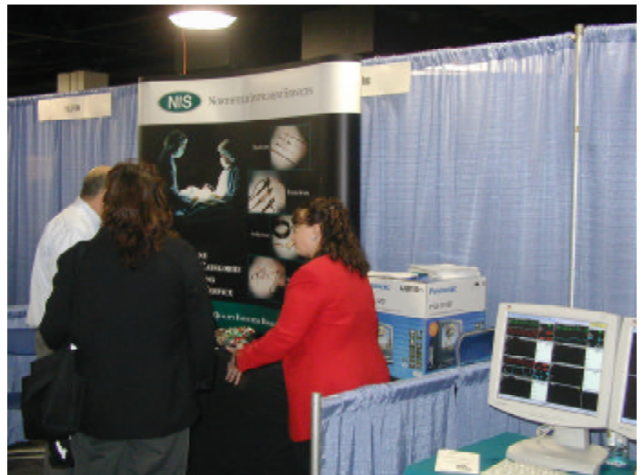
Northfield Instrument Services booth