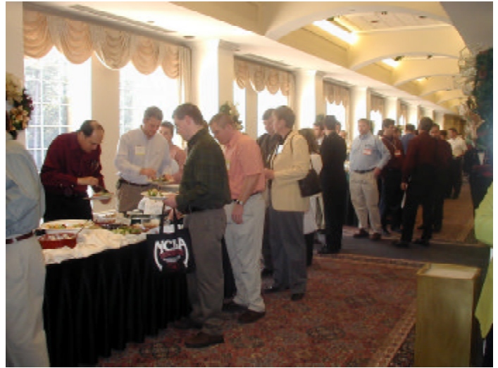
Time to Eat !!