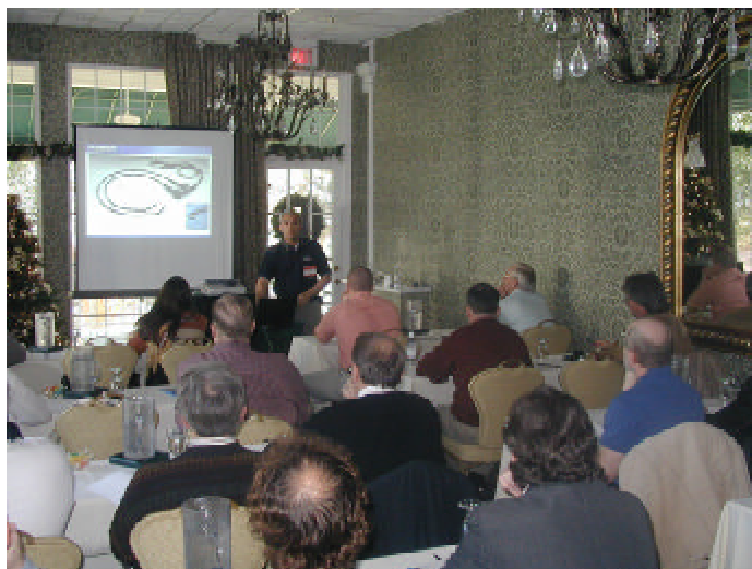
Managing Endoscope Uptime class