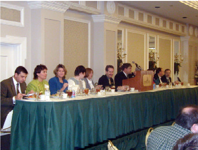
NCBA Business Meeting on Tuesday