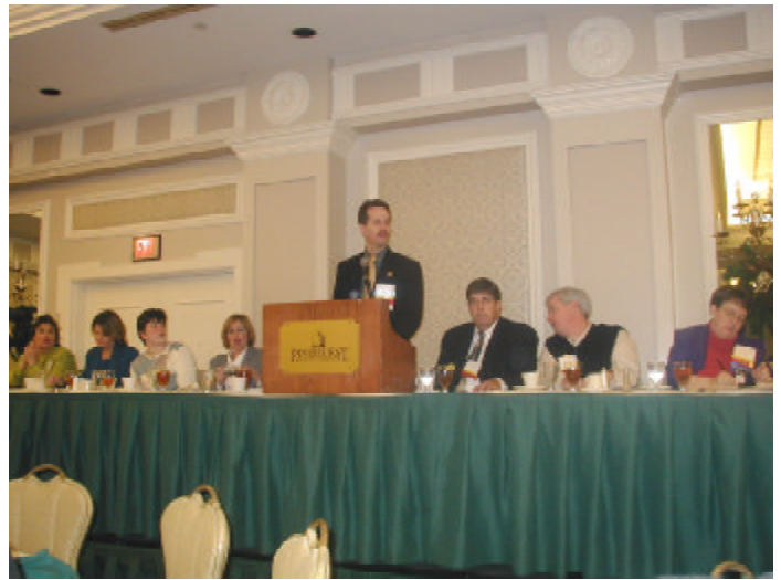
NCBA Board of Directors Business Meeting