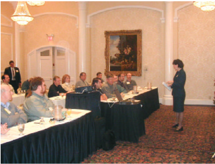
Working with Difficult People class