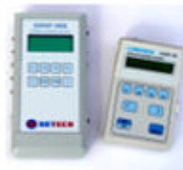
Pacemaker Analyzers and Defibrillator Testers