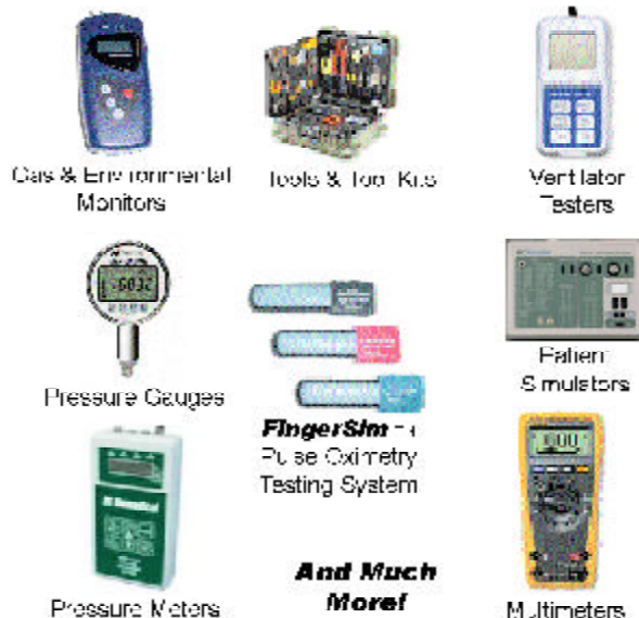
Gas & Environmental Monitors