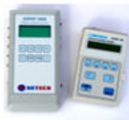
Pacemaker Analyzers and Defibrillator Testers