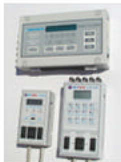
Electrical Safety Analyzers