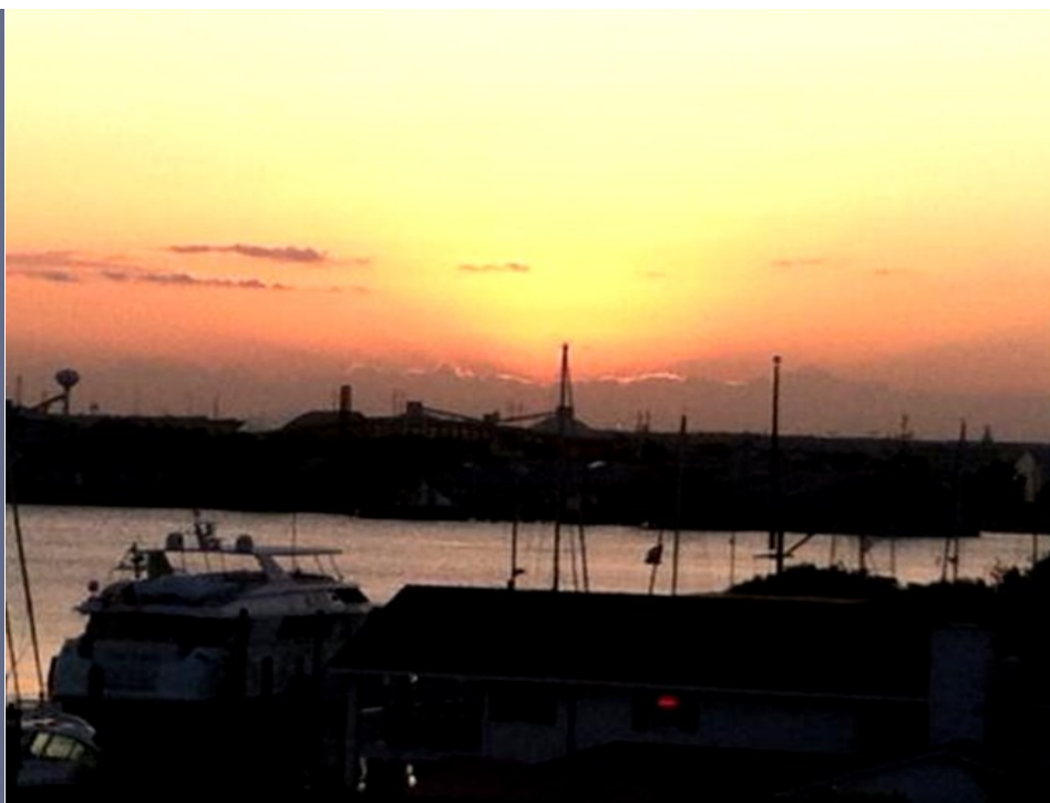
2014 NCBA Board Retreat Photo