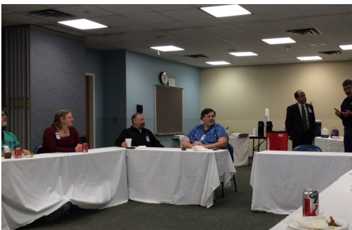
BBQ for the winners!