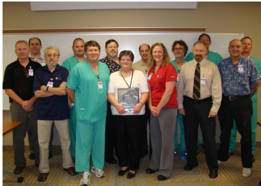
Rex Healthcare Biomedical Engineering Team!