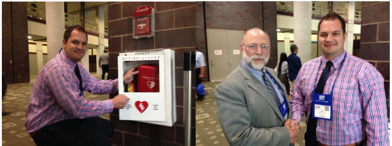
Codi inspect AED in Austin Convention Center