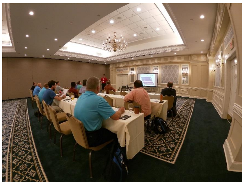
Intro to DICOM/PACS