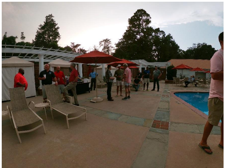
Networking by the Pool